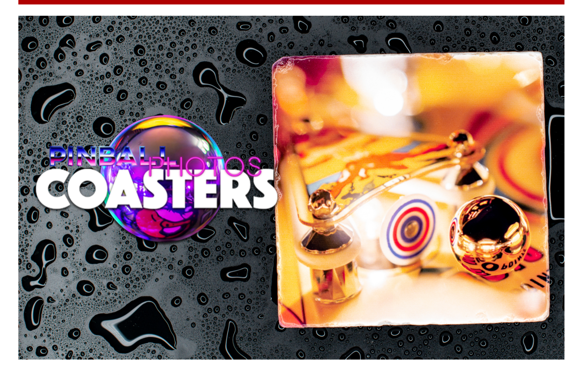
Our friends at Pinball Photos have announced beautiful pinball themed coasters!!

Our exclusive Stone Pinball Coasters are made of natural stone, giving each piece an unique style as two will never be alike.